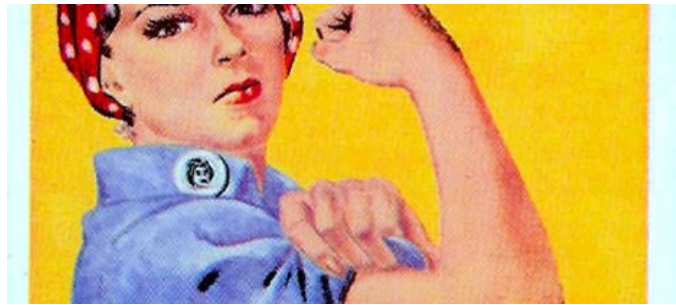
The World War II Home Front > ARTICLE