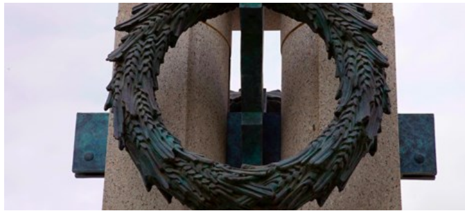
Sacrificing for the Common Good: Rationing in WWII > ARTICLE