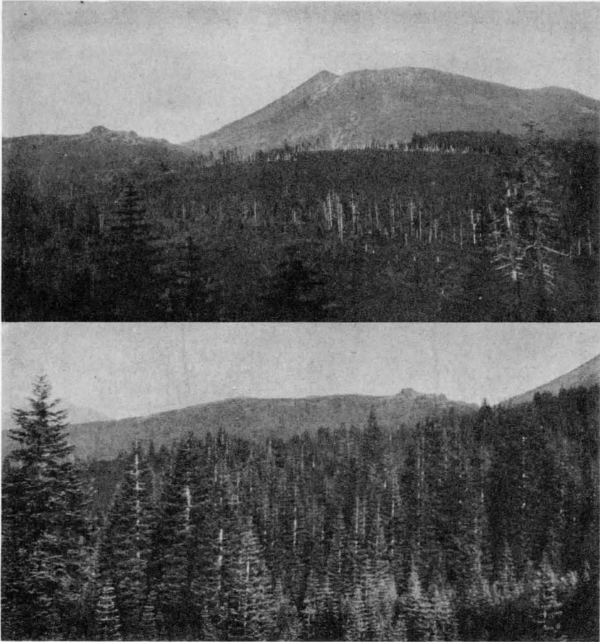
Extensive brush fields in the Latour State Forest area indicate the effect of repeated fires. The dense stand of poles and young thrifty timber, below, shows what can be expected in 20 to 30 years if fire can be kept out.

The Division will develop this forest into a practical demonstration area and it will be the center of our State Forest system in Northern California.