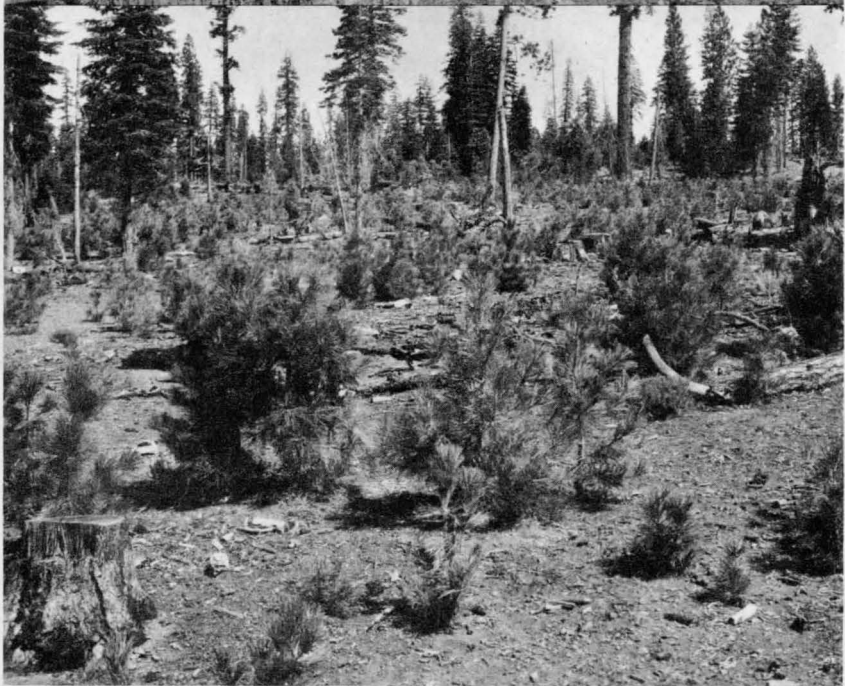
Productive cut-over lands will be purchased by the State when reforestation is not assured under private ownership.