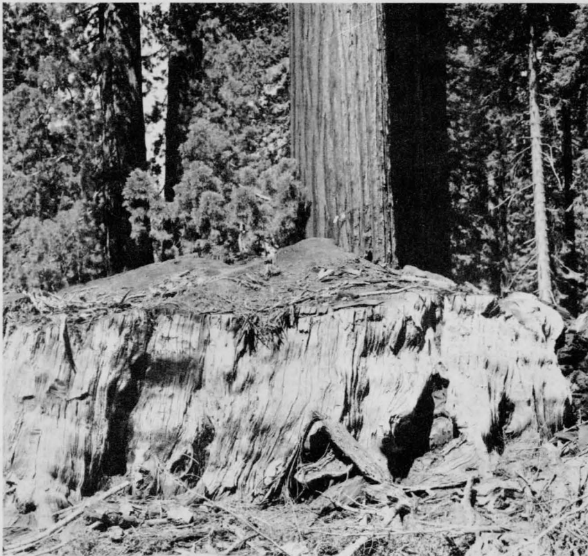
Centennial Stump —Indicative of resource waste and misuse that has plagued American forests since early in the 19th century, is this huge tree stump in the Mountain Home State Forest. The tree (a Big Tree— Sequoia gigantea ) was cut down for the sole purpose of sending a section of it to the centennial exposition in Philadelphia in 1876.

Presently the Division's forest technicians are busily engaged in drawing up management plans for both State Forest areas. Preliminary work will begin on the forests during the coming year.