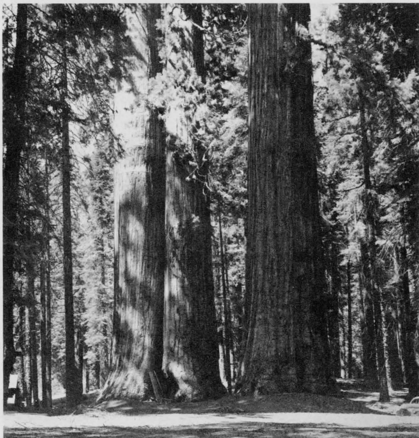
Typical grove of medium-large Sierra Redwoods ( Sequoia gigantea ) in the newly acquired Mountain Home State Forest. The tract contains about 3,000 trees of this size.

With the addition of the Latour Forest and the Mountain Home Tract, the Division is now administering 14,777 acres of forest land which is a start of the State Forest system.