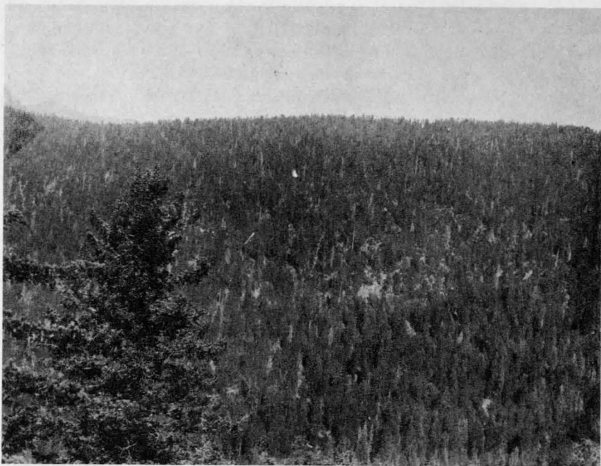
A mixed conifer stand of timber on the Latour State Forest.