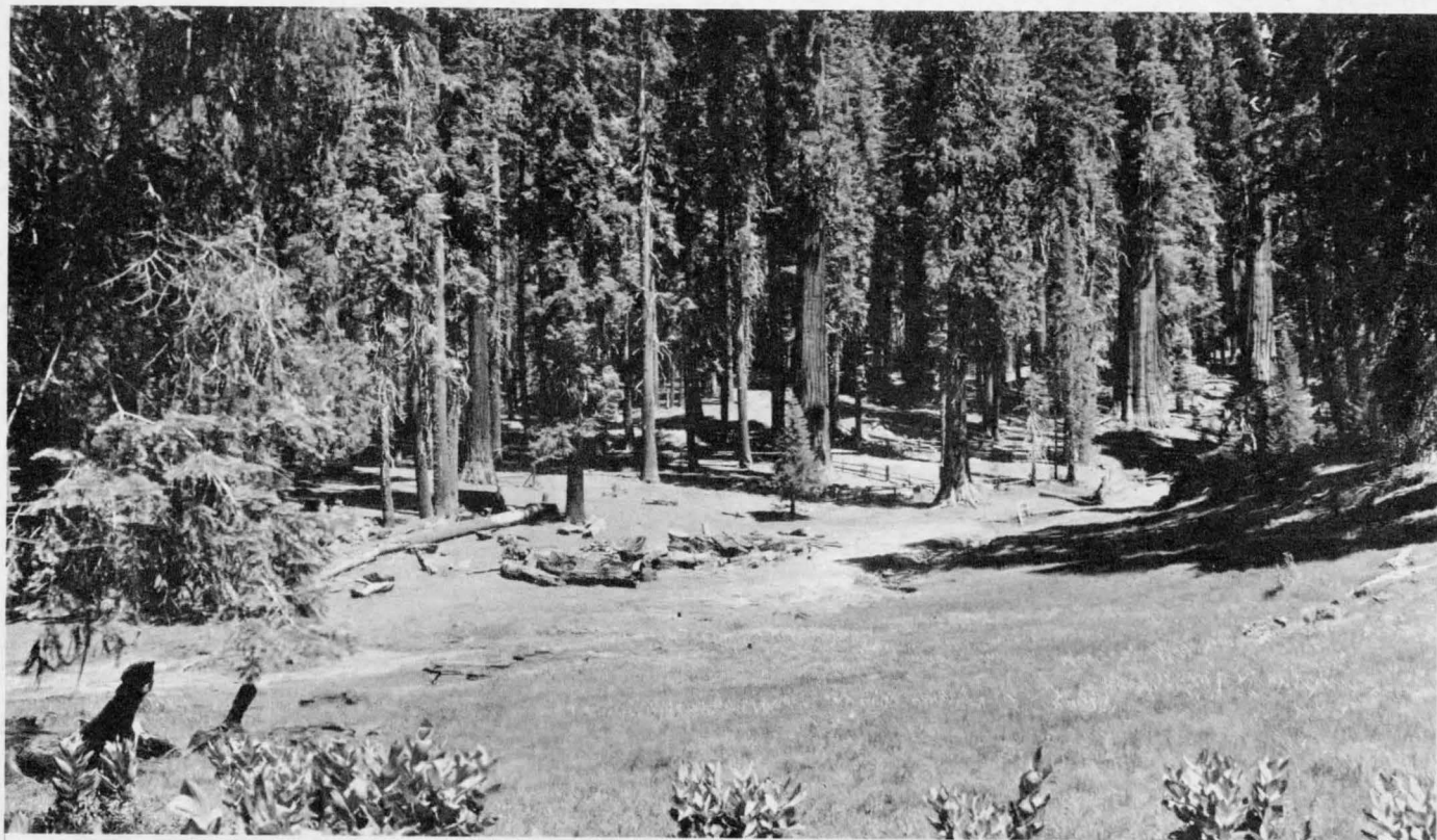
Looking across a mountain meadow into a grove of medium-large Sierra Redwoods ( Sequoia gigantea ) on the Mountain Home State Forest.