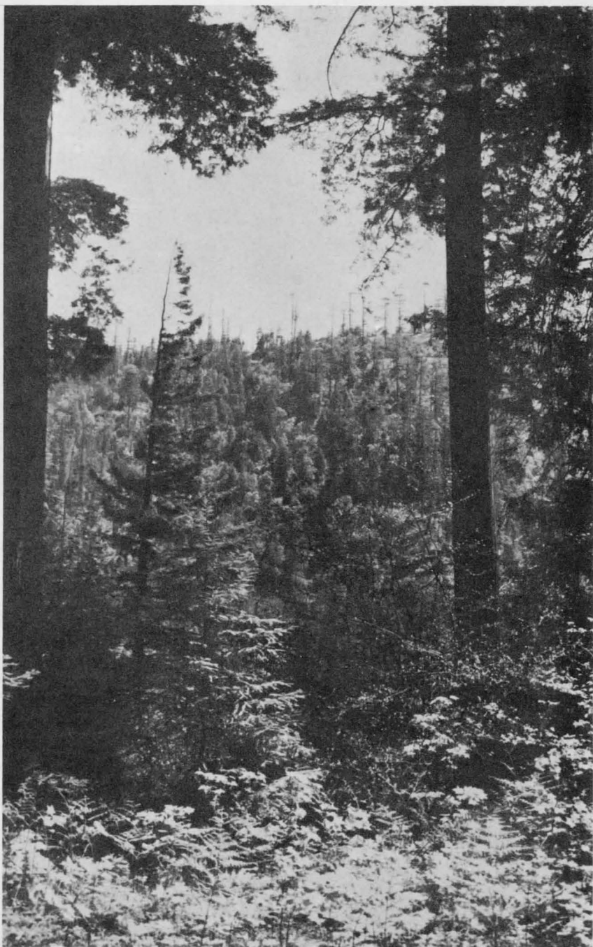
Virgin and second-growth Coastal Redwoods ( Sequoia sempervirens ). The State will acquire such forest lands on which sound silvicultural, management, and utilization practices will be demonstrated.